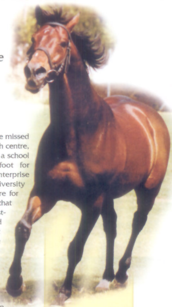
Stallion Steinbeck, a worthy son of world champion sire Mr. Prospector