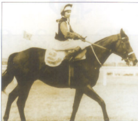
Manitou (Grey Gaston - Dusty Marta)