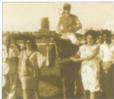
Enterprising (Grey Gaston - Salvation) One of the greatest colts in Indian Turf History