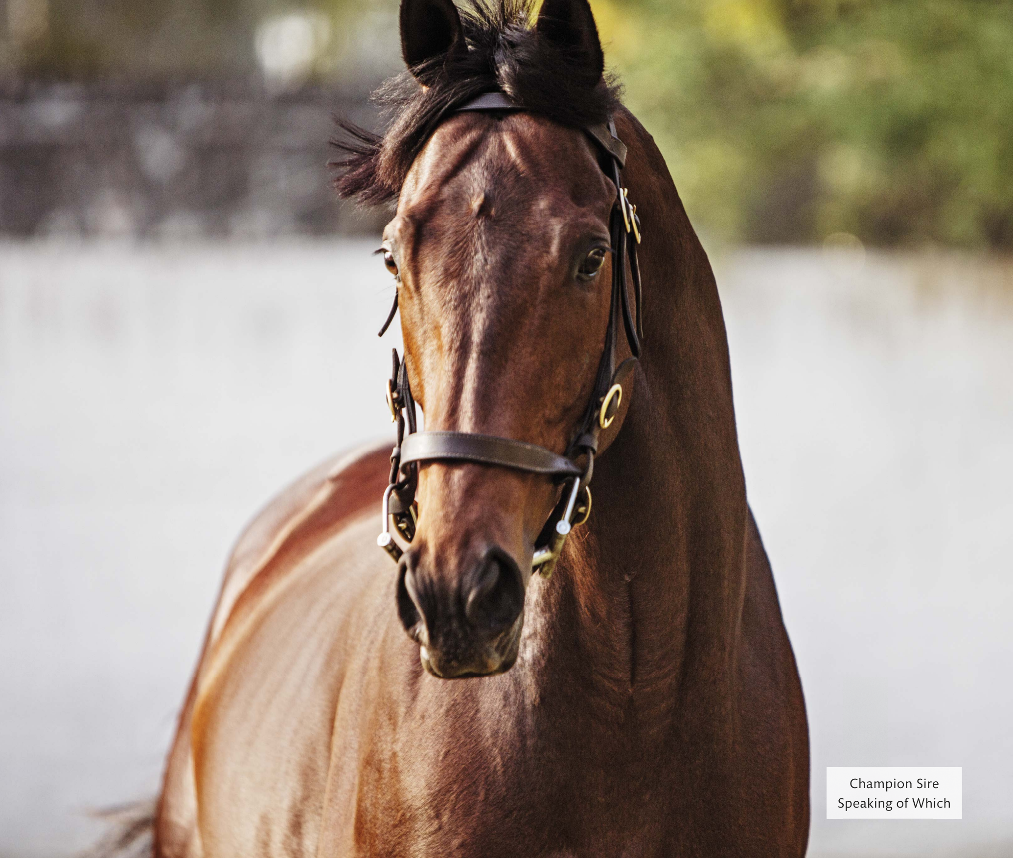
Champion Sire Speaking of Which